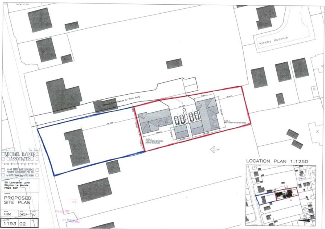
Application 07/00951/OUT – Withdrawn